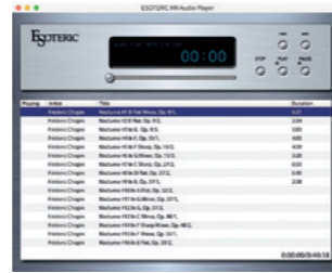
ESOTERIC HR Audio Player

Music Player Application (Complimentary)