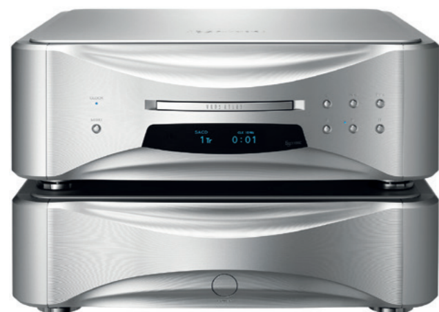
Grandioso P1X Super Audio CD Transport

Accommodating a newly developed drive mechanism the "VRDS-ATLAS", an ESOTERIC ultimate Super Audio CD transport.