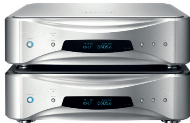
Sold in stereo configuration as shown.