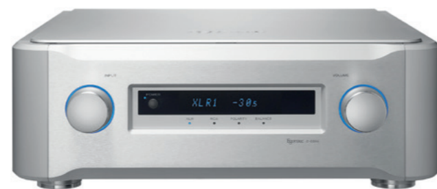
C-03Xs Stereo Linestage Preamplifier

Inheriting the expressive power of the Grandioso C1. A dual mono preamplifier that accommodates five built-in power transformers