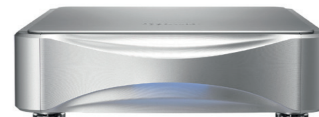
Grandioso PS1 External Power Supply

A dedicated external reinforced power supply unit that further enhances the music playback potential of the Grandioso K1X.