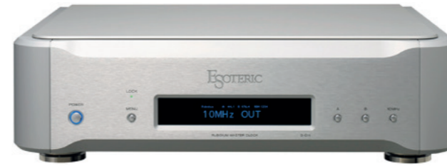
G-01X Master Clock Generator

A rubidium clock generator that inherits technologies of the Grandioso G1, supporting various clock formats.