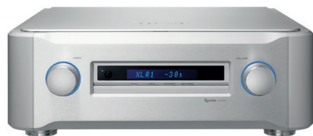
C-02X Stereo Linestage Preamplifier

Inheriting the expressive power of the Grandioso C1. A dual mono preamplifier that accommodates five built-in power transformers