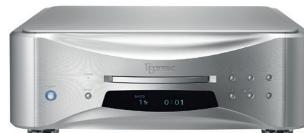
Grandioso K1X Super Audio CD Player

The VRDS-ATLAS, and Master Sound Discrete DAC. Now, fruited to an integrated Super Audio CD player in the name of Grandioso.