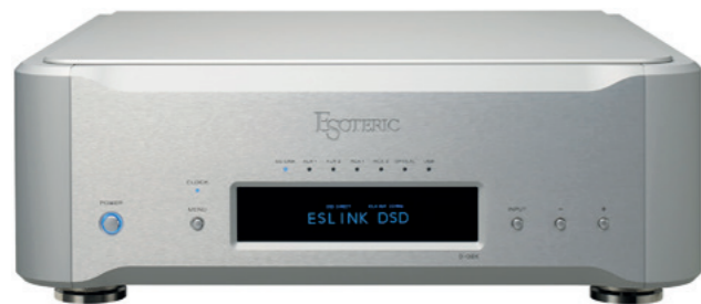
D-02X 36bit Dual-monaural D/A Converter

A design concept of the Grandioso is condensed into a dual mono unit.