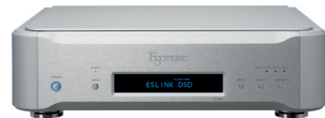
D-05X 34bit Dual-monaural D/A Converter